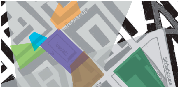
Figure 2. Active regions attached to the SNUs collected in the common-place-book visualized on the city map.

The activation regions assigned to the SNUs serve to assure the spatial interrelation of the units combined in the narration (cf. Fig. 2). A SNU can only be incorporated in the current narration stream when the listener sojourns in the activation region of the SNU. If the local context (i.e. the activation region) of the currently playing SNU is left, the audio signal is faded out notifying the listener that he is about to lose the plot. In this situation the listener faces the choice of either returning to the current narration or interrupting the current narration sequence and seeking after new whispering tracks. In addition to the active region, every SNU is classified into one or multiple topics. Consequently, the thematic coherence can be assured by requiring at least one common topic among subsequent SNUs, unless the next one to be chosen is an opener. The opening of a new narration cycle thus involves the freedom to completely change the topic of the narration.